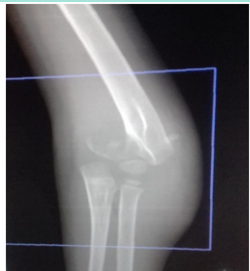
Figure 1: X-ray of the front of the elbow showing an anterior dislocation of the elbow with olecranon fracture.

The child was given an open pit reduction and skewering of the olecranon. The development has been very favourable. Anterior elbow dislocation in children is an exceptional injury. It represents a real therapeutic emergency that involves the search for an associated lesion such as an olecranon fracture.