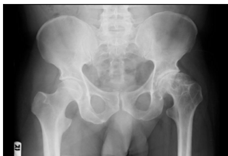
Figure 1: Initial Pelvis with Hip antero-posterior radiograph showing healed Perthes disease with advanced arthritis of left hip joint.

Following the procedure there was a dramatic improvement in the general condition of the patient. This was corroborated by the normalization of the WBC and CRP value, which fell to 58 mg/L post operatively. No organism was isolated on the culture report. The patient was pre-emptively kept on intra-venous flucloxacillin after