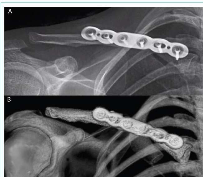
Figure 2: Radiograph and postoperative CT of right clavicle following corrective osteotomy with autologous bone grafting and superior plate fixation of right clavicle.