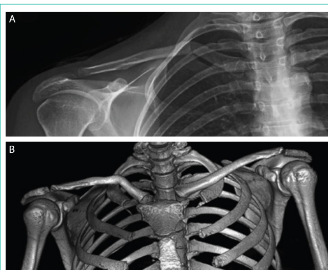
Figure 1: Anteroposterior radiographs of right clavicle demonstrating angulated and shortened malunion (A) and preoperative CT of right clavicle showing 80 degrees of apex postero-superior angulation (B).

After a failed trial of nonoperative measures, to include physical therapy, shoulder injections, and activity modification, the decision was made to proceed with a corrective osteotomy using superior plate fixation and autologous bone graft from the ipsilateral distal radius (Figure 2). Post-operatively, the patient had near anatomic