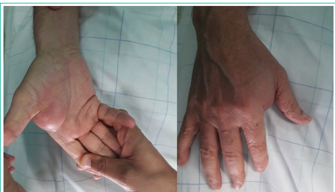
Figure 5: Clinical Aspect of the Thenar Mass in the Right Hand.