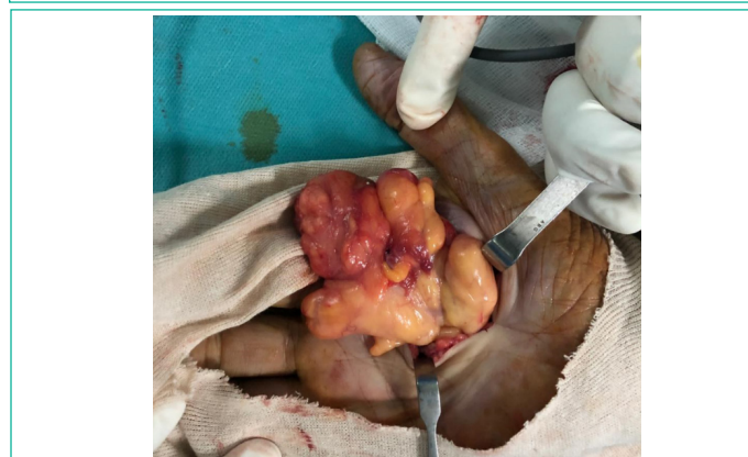
Figure 8: Macroscopic view of the giant arborescent lipoma during excision.