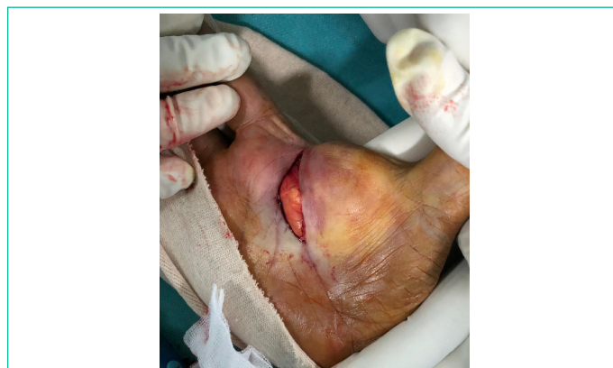
Figure 7: Incision along the thumb opposition crease.