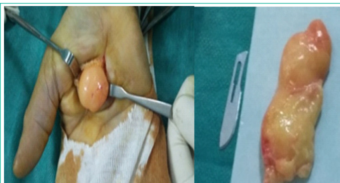
Figure 4: Intraoperative aspect of giant lipoma.

The macroscopic examination of the excised specimen (11cm×08cm×2.5cm) describes a benign lipoma with a homogeneous yellowish fatty appearance (Figure 9). Furthermore, microscopic analysis confirmed the diagnosis of a benign conventional lipoma without cellular atypia.