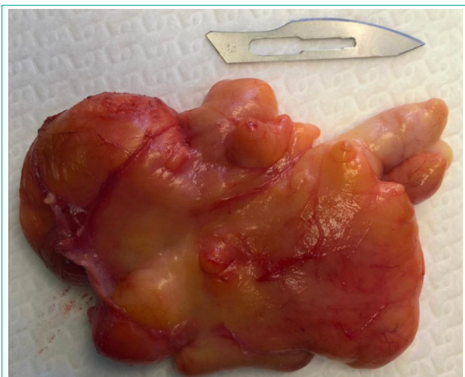
Figure 9: Homogeneous yellowish macroscopic appearance of the benign lipoma.

Both patients underwent functional rehabilitation sessions, and with a follow-up of ten months, the course was marked by complete recovery of distal sensory-motor disorders without clinically detectable local recurrence.