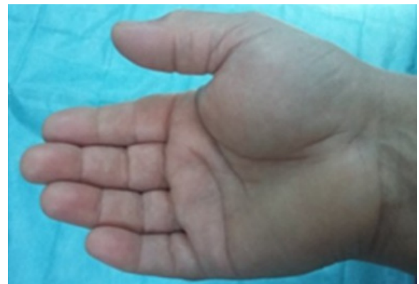
Figure 1: Clinical aspect of giant lipoma of the hand.

The standard radiograph (Figure 2) showed soft tissue opacity in the thenar compartment without bone lysis. Electromyography revealed sensory latency in the area of distribution of the median nerve.