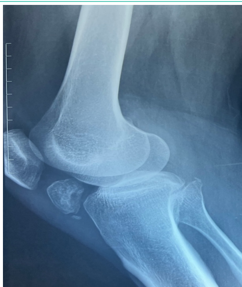
Figure 1: A lateral X-ray knee image showing an osseous mass located behind the silhouette of the patellar tendon.

After six weeks of postoperative follow-up, all symptoms related to Hoffa's disease disappeared, and the patient regained painless mobility of his left knee, hence a control MRI performed after one year cleared any local recurrence.