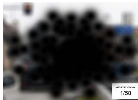
Figure 1: Subject with visual acuity equal to 1/50 and 16% residual VF (coefficient of visual impairment = 99.6%). With the adoption of the digital system, it must be entered in level 1 of the scale while the judging commission has entered it in level 3.