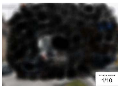
Figure 2: Subject with visual acuity equal to 1/10 and an 11% residual VF (coefficient of visual impairment = 98.9%). With the adoption of the digital system, it is entered in level 2 of the scale while the judging commission has entered it in level 4.

Coherent valuations: 38.1%, CI = [23.8, 60.1]