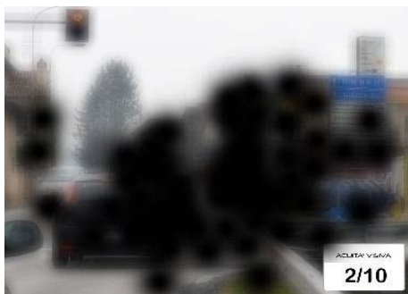
Figure 4: Subject with visual acuity equal to 2/10 and 47% residual VF (coefficient of visual impairment = 90.6%). With the adoption of the digital system, it must be entered in level 4 of the scale while the judging commission has entered it in level 2.