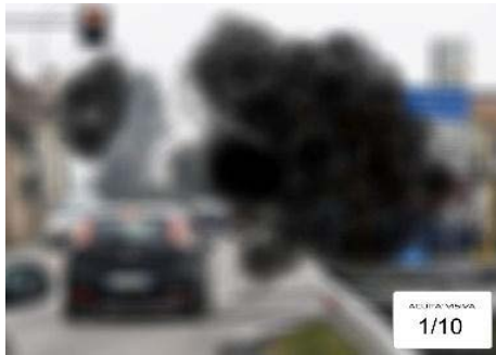
Figure 3: Subject with visual acuity equal to 1/10 and 50% residual VF (coefficient of visual impairment = 95%). With the adoption of the digital system, it must be entered in level 4 of the scale, while the judging commission has entered it in level 2.