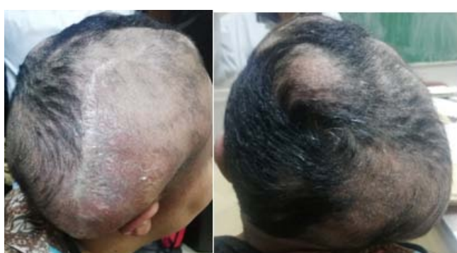
Figure 4: Clinical tumor regression after radiotherapy.

proliferation was 30% in hot-spot zones. Finally, we don't find actin and desmin expression excluding the diagnosis of leiomyosarcoma.