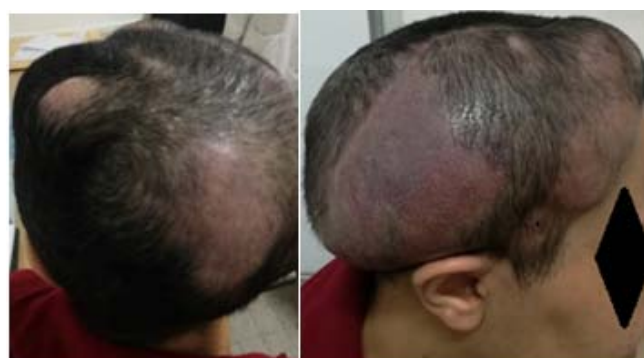
Figure 2: Voluminous increased temporoparietal mass.

were irregular and the nucleocytoplasmic ratio was high. Cellular anaplasia was severe with the presence of atypical nucleus tumor cells. This concluded into aggressive anaplastic meningioma recurrence with infiltration of adjacent bone and adjacent glial parenchyma. The immunohistochemically study revealed cell Epithelial membrane antigen (EMA), Vimentin and PS100 cell expression. The Ki 67 index