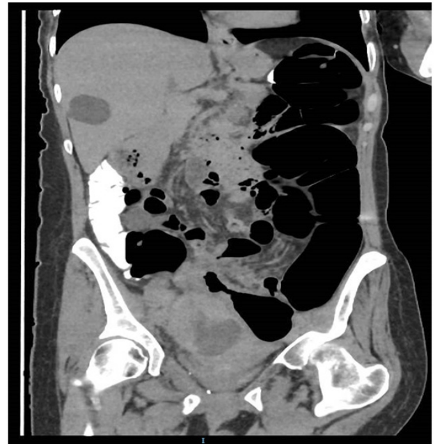
Figure 2: Coronal view of Ct pneumocolon with additional right adnexal part solid part cystic mass displacing the uterus to the patient’s left and Incidental Simple.