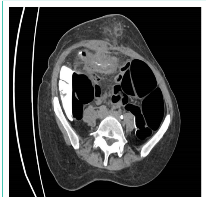
Figure 1: Axial view of a CT Pneumocolon showing luminal narrowing in the sigmoid with extensive infiltrative peritoneal and omental disease and concomitant disease extension into the anterior abdominal wall and subcutaneous.

The patient was also followed up with a cystogram suggesting no evidence of urinary extravasation, but bilateral reflux noted to the renal pelvises. She has been recovering well since the operation with no complications.