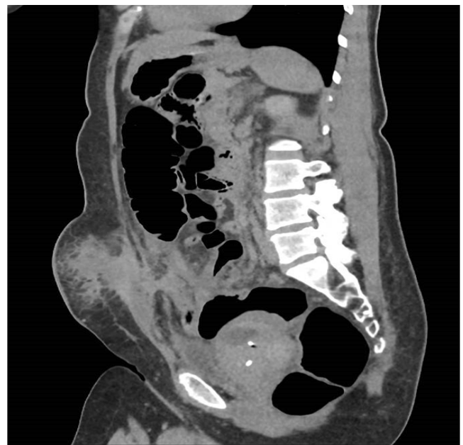
Figure 3: Sagittal View of CT showing the IUD in situ and a clear view of the infiltrating mass.