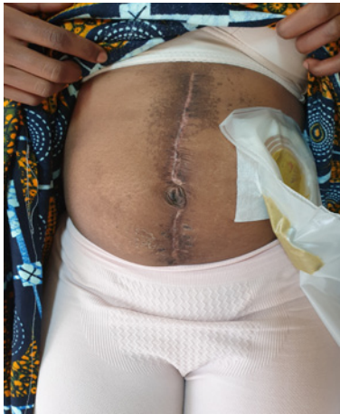
Figure 3: Healed midline incision with colostomy in situ .

whole blood intra-operatively. Her control hemoglobin was 11.5 g/dl day two post operatively.