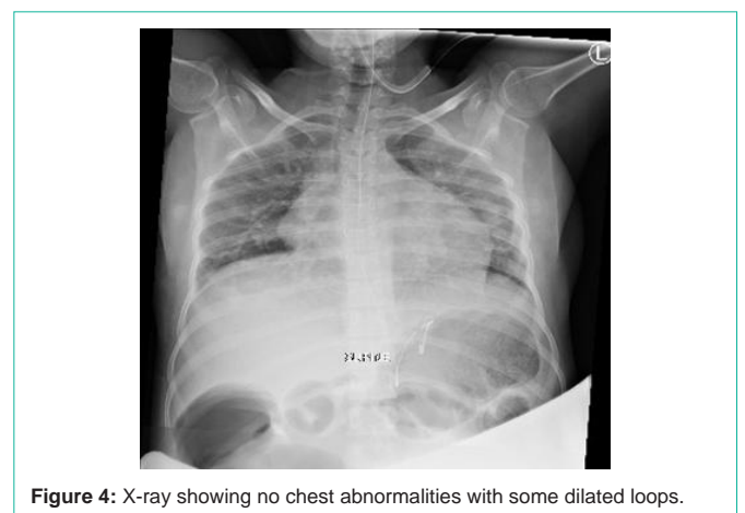
Figure 4: X-ray showing no chest abnormalities with some dilated loops.

Two months later, she was admitted to the surgical unit for an elective closure of her colostomy. Her haemoglobin was 11.2 g/dl