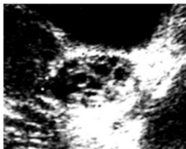
Figure 1: Presence of multiple follicles of small size on TA ovarian scan.