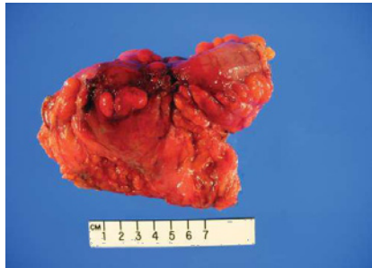
Figure 2: Resected sigmoid colon with central maroon puckered indurated area, hemorrhagic serosal implants and serosal adhesions.

Rokitansky, it is present in up to 10% of women in reproductive age group [1]. Extra pelvic endometriosis is seen in 3.8% to 37% of all cases [2]. In 5.3% to 12% of these women, endometriosis involves the bowel [3].