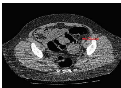
Figure 1: Pre-operative CT colonography shows "apple core" lesion within mid-sigmoid, measuring 3.3cm with severe stenosis of the lumen. Diverticulosis of the sigmoid seen. No extra colonic findings.

Endometriosis is a progressive and benign estrogen-dependent disease defined by the presence of endometrial tissue (glands and stroma) outside the uterine cavity. First described in 1860 by Von