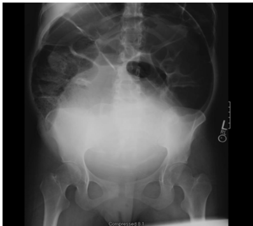
Figure 1: Plain abdominal X-ray at 31 weeks gestation demonstrating a large dilated colon loop and a fetus in the maternal pelvis.