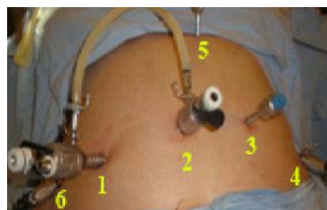
Figure 1: Port 1 for needle introduction.

First, we create a sliding loop at the end of a 3/0 polypropylene