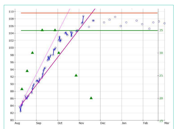
Figure 1: Figure 1 illustrates weight gain and maintenance for an anorexia nervosa patient in the Partial Hospitalization Program (PHP). The circles represent weight on days of PHP with connected lines representing contiguous days of treatment. Spaces early in treatment reflect weekends and later denote outpatient meetings after discharge from PHP. The goal weight range for this patient is represented by the two parallel lines at 104 lbs. and 109 lbs. respectively. The triangles are Calorie levels as seen on the right vertical axis.

examples of weight charts like the one in Figure 1 which shows this steady and predictable increase in weight followed by maintenance in the goal weight range. It is both surprising and reassuring to many patients how rapidly metabolic rate is boosted in response to increases in Calories prescribed [25] (see triangles in Figure 1). Patients are encouraged to view food as "medication" and the "dosage" is designed to increase metabolic rate while creating predicable weight gain. If weight gain is not the main goal of treatment, then the Calories are adjusted to maintain a stable body weight that is consistent with the patient's genetic and/or biological predisposition and this can be expected to lead to a marked decline in disturbed eating patterns, as well as emotional and cognitive symptoms. It is our assumption that normalization of body weight is absolutely required to promote "healing" from the ravages of chaotic eating patterns and chronic starvation/dieting.