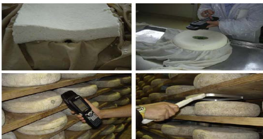
Figure 2: Cheese wheels identified by means of circular LF or HF tags. Transponders are applied under a casein disk during curd molding on the side (up, left), or on the cheese wheel face (up, right). During ripening the remains included in the cheese rind and can be detected by different handled models when placed on shelves in the storage room (down, left and right figures).