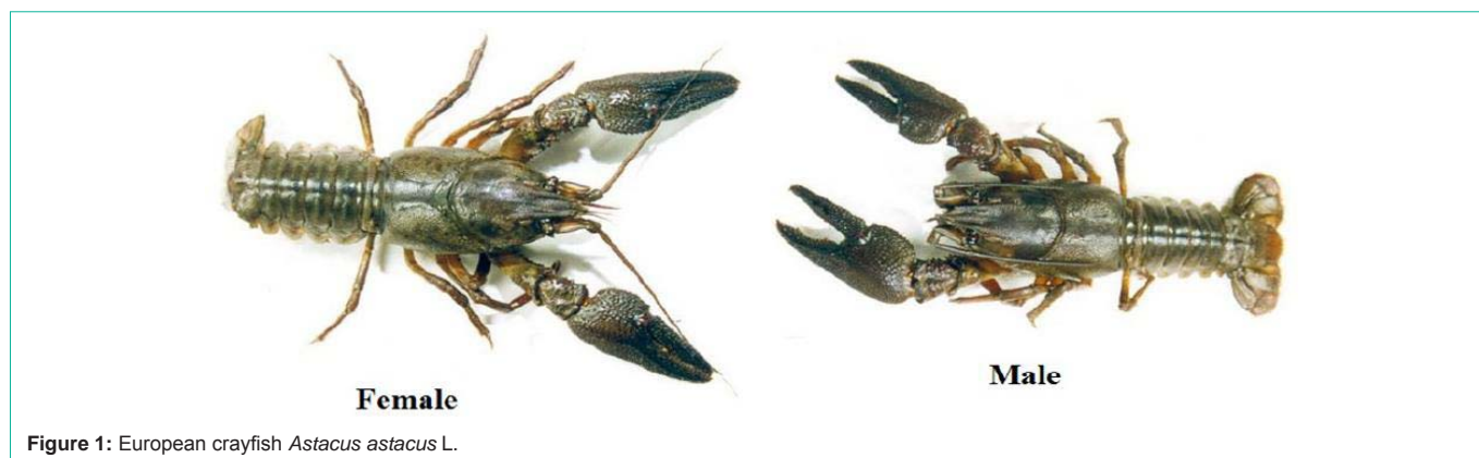
Figure 1: European crayfish Astacus astacus L.