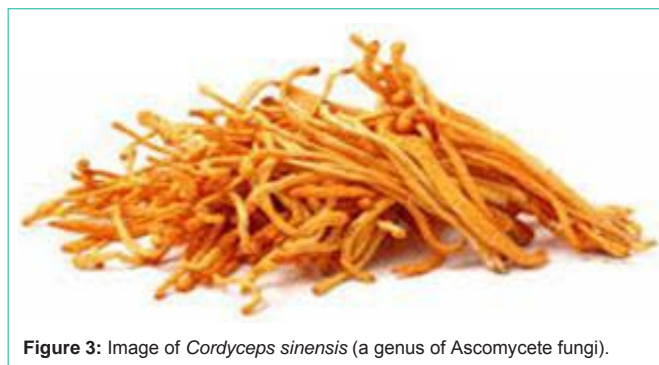
Figure 3: Image of Cordyceps sinensis (a genus of Ascomycete fungi).