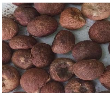
Figure 4: Dried form of Arecanut.

grown in Western and Eastern Ghats, North and East parts of India including Karnataka, Kerala, Assam, Meghalaya, Tamil Nadu and West Bengal. Karnataka leads the production of arecanut in our county accounting for 43% area wise and 46% production wise followed by Kerala showing 24% and 23% respectively. The areas of Shimoga Chikkamagaluru, Tumkur, Uttara and Dakshina Karnataka are the places where AN production is seen. Shimoga ranks first in the area (23%) and production (21%) of AN in Karnataka followed by Chikkamagaluru. The two major varieties of processed form of AN, Chali or the sun dried type and Red or boiled type available. Chaliis mainly produced in Dakshina Karnataka and parts of Uttara Karnataka.