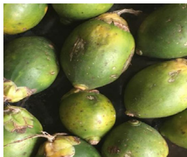
Figure 1: Unripe form of Arecanut.

Standard working solution of 10 to 100µl (10µg-100µg) was taken in six different test tubes. Volume was brought up to 100µl in each test tube by adding water; later 400µl of anthrone reagent was added and mixed well. The test tubes later were incubated in the water bath for 8mins, and then cooled at room temperature and measured the optical density by photoelectric calorimeter at 630nm or red filter can be used. A blank solution with 4ml of anthrone reagent and 1ml was prepared. Calibration curve was constructed on a graph paper by plotting absorbance at 630nm on the y-axis and glucose concentration of 10µg-100µg on X-axis. Sugar concentrations in the sample from the calibration curve was computed [15].