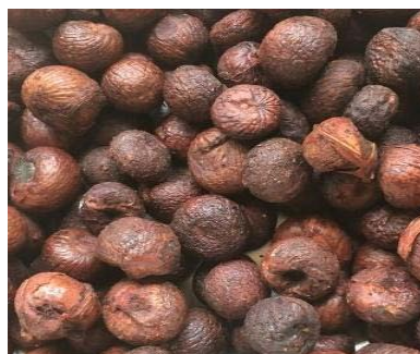
Figure 3: Roasted form of Arecanut.

Arecanut is one of the important and a major cash crop agricultural product in many parts of the world and its production is localized to few states in India. It is one of the significant crop