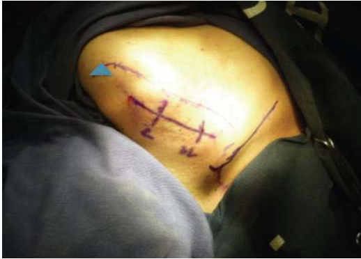
Figure 1: Anatomical landmarks to spinal accessory to suprascapular nerve transfer by posterior approach. The supra scapular and spinal accessory nerves are located 7 and 11 centimeters medial to the acromioclavicular joint (triangle), respectively.