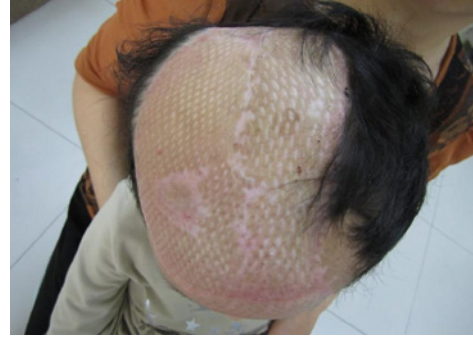
Figure 5: Six months after operation, skin transplantation was successful.

At present, many patients with traumatic brain injury can be treated within the so-called "golden hour". It's very important for patients' outcomes. Especially for open craniocerebral injury, debridement should be performed to remove foreign object and contaminants and make wounds closure as soon as possible. However, some patients with open craniocerebral injury cannot be debrided in time and may suffer infection. If infection is happened, the treatment will be more difficult. As the patient in our report, she lived in a remote mountain area and could not reach hospital in time. The first debridement was performed 24 h post injury. Moreover, there was still some foreign object remained. All these resulted in severe infection.