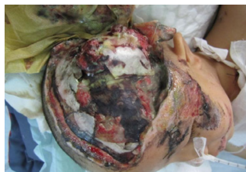
Figure 1: On admission, scalp, skull, and dura defect could be found in left frontal, temporal, and parietal areas. Purulent discharge and necrosis tissues were found at the same time.

times to identify the causative pathogens. Flavobacterium odoratum , Escherichia coli , Pseudomonas aeruginosa , and Acinetobacter baumannii - Acinetobacter calcoaceticus complex isolates were found in those tests. Sputum culture revealed that the main pathogens were Acinetobacter baumannii , Acinetobacter haemolyticus , and Pseudomonas aeruginosa . Tazocin, vancomycin, cefoperazone/tazobactam, and tienam were consecutively used for antibiotic treatment. After treatment with a combination of debridement and antibiotics and wound dressing change, the patient regained consciousness, and her temperature returned to normal on the 39 th day after admission. The patient exhibited grade I muscular strength with normal muscular tension in the right limb, and grade V muscular