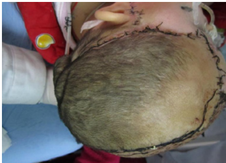
Figure 4: Rotating scalp flap was survived after transplantation.

strength, also with normal muscular tension, in the left limb. As infection in the wound was completely controlled and granulation tissue was fresh (Figure 3), skin transplantation was performed on the 51 st day after admission. The defect areas were covered by a rotating scalp flap from the right frontal and parietal areas. Subsequently, free skin flaps were taken from the left side of the back and transplanted to cover the donation site on the right frontal and parietal areas. The transplanted skin flap had sufficient blood supply and acquired a ruddy color. After operation, the transplanted skin survived (Figure 4). The patient recovered and was discharged on the 71 st day after admission. Six month after injury, the patient's Glasgow Outcome Score was 4 (Figure 5). However, the skull defects are still waiting for treatment.