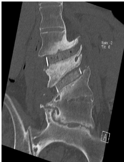
Figure 4: Coronal postoperative CT images with interbody graft in place.