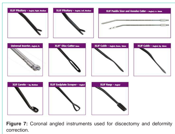
Figure 7: Coronal angled instruments used for discectomy and deformity correction.

slides that protect the endplates and provide a semirigid pathway for the graft to enter the disk space (Figure 3). Once the slides are placed, the interbody graft is attached onto an angled inserted and malletted down in between the slides into the disk space under fluoroscopic guidance. Frequent AP and lateral images are taken to ensure that the graft is entering the disk space and not being placed too anteriorly into the peritoneal space or into the great vessels or too posteriorly into the spinal canal. X-rays also ensure that the graft is not being hammered into the vertebral body endplate. After the interbody graft is in proper position, the slides are removed and repeat radiographs are taken to ensure that the graft has not moved during slide removal.