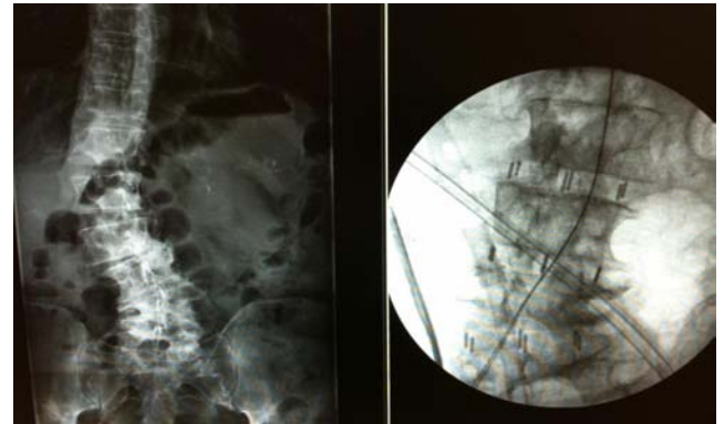
Figure 6: Preoperative and postoperative radiographs showing the degree of coronal deformity correction achieved with interbody graft placement at the L2-3, L3-4, and L4-5 levels.

planning with regard to the number of skin incisions required and the need for psoas retraction. At times, it is advantageous to approach the spine from the convex side because it is easier to enter the disc space. However, the disadvantage of this approach is the need for multiple skin incisions at times to reach multiples disc levels and the need to retract against the psoas while it is already stretched taught over the lumbar convexity. At other times, it is advantageous to approach from the concave side because it is easier to treat multiple disc spaces through the concave size but osteophytes and bony overgrowth over the space may make entering the actual disc space difficult. The last