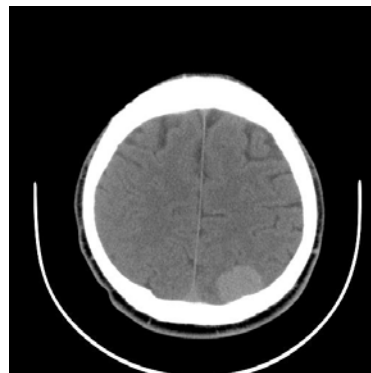
Figure 1: Non-contrast head CT demonstrating left parieto-occipital lesion.

muscle, an elastic lamina, and are sometimes calcified or ossified. The lumina can be thrombosed and show attempts at re-canalization. The term "cavernous angioma" has been used interchangeably