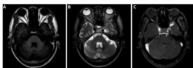
Figure 1: Cranial MRI for the 74-year old man with RON. (A) Axial, T1-weighted image, (B) Axial, T2-weighted image and (C) T1-weighted image with gadolinium contrast enhancement. The images showed normal signal in both optic nerves and no typical radiation-induced brain injury was noticed.

With regards to the radiotherapy history, progressive diffuse painless vision loss in both eyes over weeks, VEP finding as well as neuroimaging result, late RON was diagnosed. Considering the unsatisfied response to corticosteroid in other hospital, we used mouse nerve growth factors (mNGF; Enjingfu, Xiamen Beida Road Bioengineering, China). 9000 Au mNGF was dissolved in 2 ml normal saline and injected intramuscularly at 18 \mu g/time, once a day for consecutive two weeks. Meanwhile, corticosteroid therapy was adapted to methylprednisolone 80mg per day intravenously for five days and followed by methylprednisolone 40mg per day for 3 days and then oral prednisolone 30mg per day. Each treatment cycle was about two weeks. His visual symptoms were gradually improved early at the second week of treatment. The patients then received repeated treatment with mNGF plus corticosteroid four times in six months and his symptoms became stable. A follow-up VEP at six months showed reappeared P100 wave in the left eye (Figure 2B). There was also improvement in visual acuity that he could recognize hand movement with left eye, although the visual acuity in the right eye did