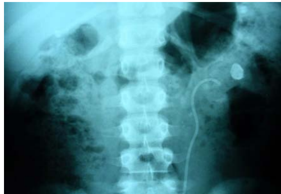
Figure 3: X-ray showing the double-J stent after the percutaneous nephrolithotomy to reduce hydronephrosis.