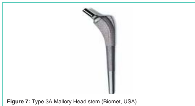
Figure 7: Type 3A Mallory Head stem (Biomet, USA).

i. Type 3A: Conical design with rounded corners and a tapered