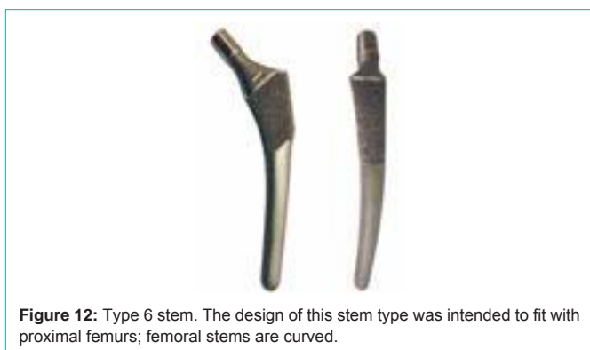
Figure 12: Type 6 stem. The design of this stem type was intended to fit with proximal femurs; femoral stems are curved.

excellent stem survival rate has been reported (96%) through more than 20 year follow up [12-15] (Figure 9).