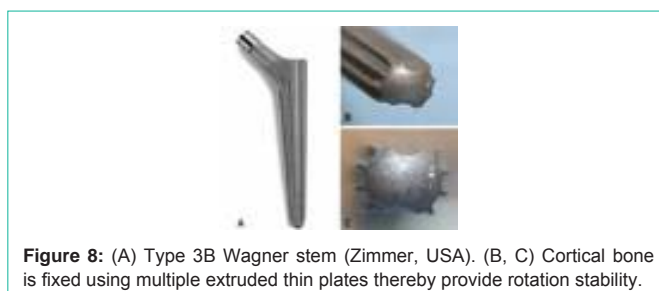
Figure 8: (A) Type 3B Wagner stem (Zimmer, USA). (B, C) Cortical bone is fixed using multiple extruded thin plates thereby provide rotation stability.