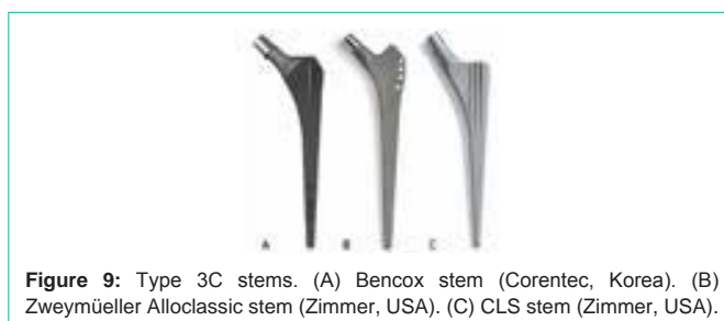
Figure 9: Type 3C stems. (A) Bencox stem (Corentec, Korea). (B) Zweymüller Alloclassic stem (Zimmer, USA). (C) CLS stem (Zimmer, USA).

shape in both planes. Coating is applied on one-third of the proximal portion and there are either protruding pins or wings that provide rotational stability. Type 3A has shown excellent stem survival rate (99%) over 10 year follow up [10] (Figure 7).