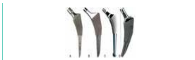
Figure 14: Types of mid-short stems. (A) Bencox M stem (Corentec, Korea). (B) Trilock stem (DePuy, USA). (C) M/L Taper stem (Zimmer, USA). (D) Taperloc Microplasty stem (Biomet, USA).

rate of these stems (99%) was reported over 10-11 years of follow-up on average [18,19] (Figure 11).