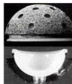
Figure 1: 1 st generation of hemispherical acetabular cup: Harris-Galante I cup (Zimmer, USA).

Theoretically, the press-fit method does not require additional fixation such as the use of screws since sufficient primary fixation