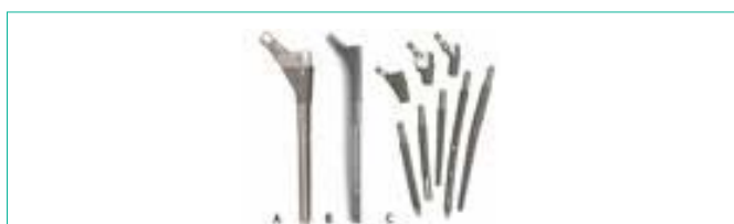
Figure 11: Type 5 stems. (A) S-ROM stem (DePuy, USA). (B) Revitan stem (Zimmer, USA). (C) Arcos stem (Biomet, USA).