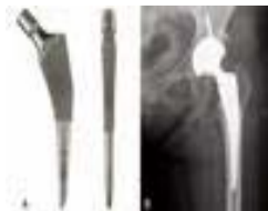
Figure 15: (A) The Bencox M stem (Corentec, Korea) representing recent stem characteristics. (B) Operative radiographs.