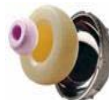
Figure 17: The Dual Mobility system (Biomet, USA) comprising two joint planes with ceramic bone head-highly cross-linked polyethylene liner-metal joint plane acetabular cup.

Recently, for similar reasons, it was attempted to reduce elasticity by making long grooves on both the anterior and posterior sides of