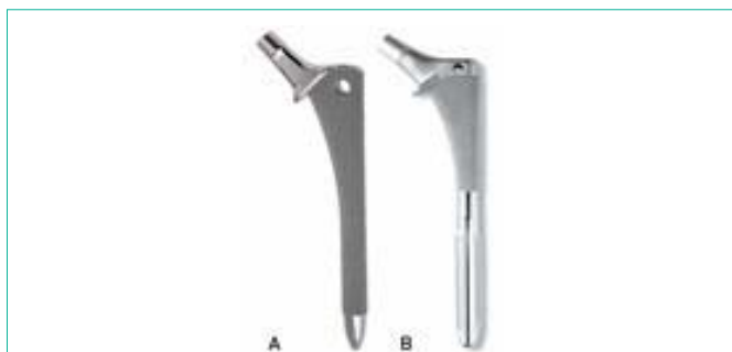
Figure 10: Type 4 stems. (A) AML stem (DePuy, USA). (B) Versys Beaded Fullcoat stem (Zimmer, USA).