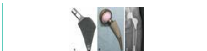
Figure 13: Short femoral stems. (A) Proxima stem (DePuy, USA). (B) Metha stem (Aesculap, Germany). (C) Clinical case. Due to existing femoral implants from knee revision, Proxima stems were utilized for hip arthroplasty.

Therefore, as the design is supposed to fix both metaphysis proximally and diaphysis distally, this type of stem is very useful for complex cases with anatomic abnormalities and rotational malalignments, such as are seen with hip dysplasia. Excellent survival