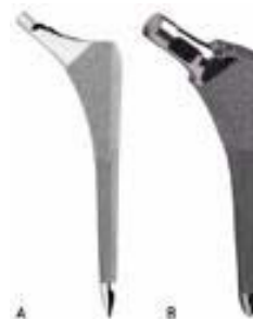
Figure 6: Type 2 stems. (A) Summit stem (DePuy, USA). (B) Echo Bi-Metric stem (Biomet, USA).

of femurs. Depending on the length of implant neck, the medial offset and vertical height can be adjusted; similarly, the vertical height can be adjusted according to depths of femoral stem into femurs.