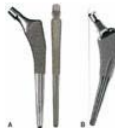
Figure 5: Type 1 stems. (A) Bencox ID stem (Corentec, Korea). (B) Taperloc stem (Biomet, USA).

Generally speaking, femoral stems are designed to place the center of rotation at the native hip center. In order for this, vertical height, medial offset, and version of femoral region should be appropriate. The vertical height is often expressed as the height from the proximal margin of lesser trochanter to the center of femoral head. Medial offset is expressed as the distance between a line passing through the vertical axis of femoral stem and the center of femoral head. Last, the version indicates the rotation angle between proximal and distal parts