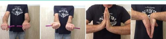
Figure 4: ROM at 1 year follow-up.

dorsal approach, to reduce the dislocated carpal bones, to repair the scapholunate ligament using an anchor and the application of K-wire between the scaphoid and the lunate. At last, the radial styloid was reduced and fixed with a K-wire. The wrist was then immobilized in a plaster cast that was removed, together with the K wires, after 6 weeks (Figure 3). The patient was given a wrist brace and prescribed an intensive functional rehabilitation program. The patient was checked at 3, 6, 12 months. Pronation/Supination was restored 3 months following the trauma while the flexion-extension was limited to 60° -0° -70°. Normal joint ROM was completely restored at 6 months. After one year, the Mayo Wrist Score was 90/100 and the patient resumed his work as a craftsman (Figure 4).