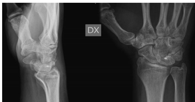
Figure 3: AP and LL X-rays, 6 week after surgery, following removal of the K-wires and the plaster cast.