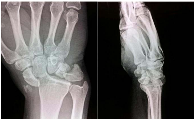
Figure 2: Pre-operative X-rays.