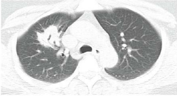
Figure 1: Initial CT of the chest with contrast - 3cm lesion in right upper lobe, which is suspicious for neoplastic lesion.