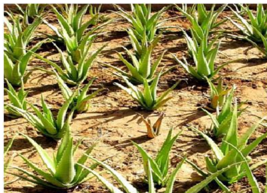
Figure 8: Aloe vera .

It can be cultivated on all types of soils including salt affected soils. However, optimum growth was observed in well drained sandy loam to loam soil at pH 7-8.5. It does not come under waterlogged and frosty conditions. It grows well under rainfed conditions and requires one weeding. C. angustifolia performs well on marginal soils