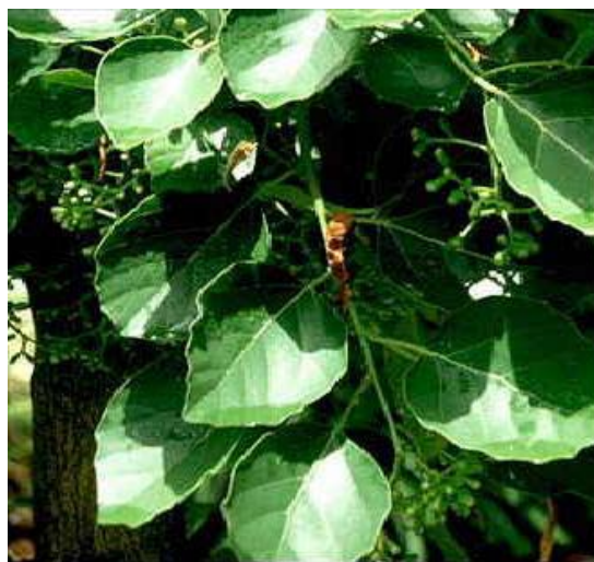
Figure 3: Cordia myxa .