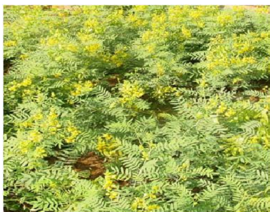
Figure 7: Cassia angustifolia .