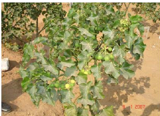
Figure 9: Jatropha curcas .

easy to propagate, found to be growing in many parts of the country, can grow and survive with minimum inputs in marginal land and not browsed by animals and seeds not eaten away by birds. Time taken for nut yield is between 2 to 5 years based on soil and rainfall conditions and yield varies from 0.5 to 3t/yr.