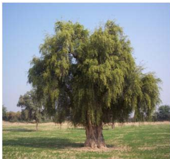
Figure 4: Salvadora oleoides tree.

Jodhpur, Jaisalmer, Bikaner, Churu, Nagaur and Jalore districts. It is a large shrub or a small tree with short twisted trunk and drooping branches (Figure 4). Fruit yield is 10-15Kg fresh fruits per mature tree. Flowering is observed in March-April while fruiting in May-June. Fruits are plucked or felled by shaking the trees vigorously. Ripe fruits are sweet and are eaten raw. Nutritional value of fruits is [7]: Protein (6%), carbohydrate (76%), fat (2%), fibre (2%), zinc (2mg/100g), phosphorous (167mg/100g), calcium (630mg/100g), manganese (2mg/100g), iron (8mg/100g) and energy (346Kcal/100g).