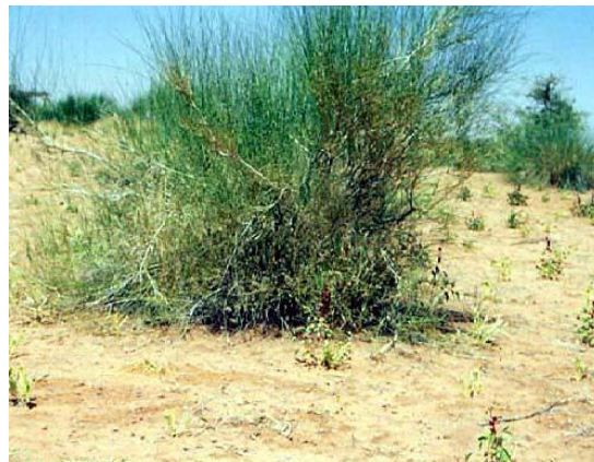
Figure 5: Leptadenia pyrotechnica.

Commiphora wightii (Arnott) Bhandari: Commonly known as guggul (Burseraceae family), it is a much branched spinous shrub or a small tree (Figure 6). In Indian sub-continent, Commiphora species