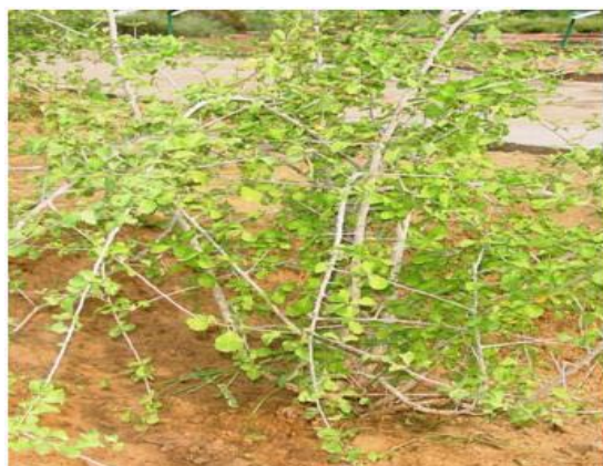
Figure 6: Commiphora wightii .