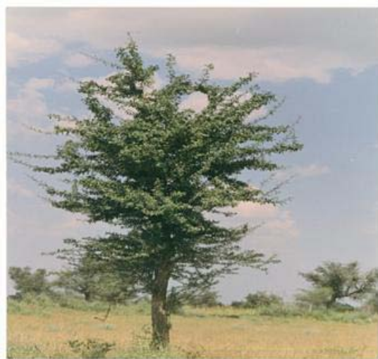
Figure 2: Balanites aegyptiaca tree.

Source: Nour [5], Duhan, et al. [7], Chandra, et al. [8], Anon [6], Rathore [4].