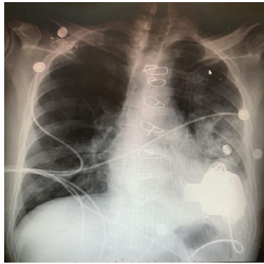
Figure 2: Post-Op Chest Radiograph demonstrating orientation of HM3®.

Interestingly, both types of technology are continuous flow pumps, an engineering design that simplified the mechanics of blood flow, extended durability, and reduced device size. These features expanded the application of the pumps to a broader patient population including pediatric and young adults with smaller body surface areas.