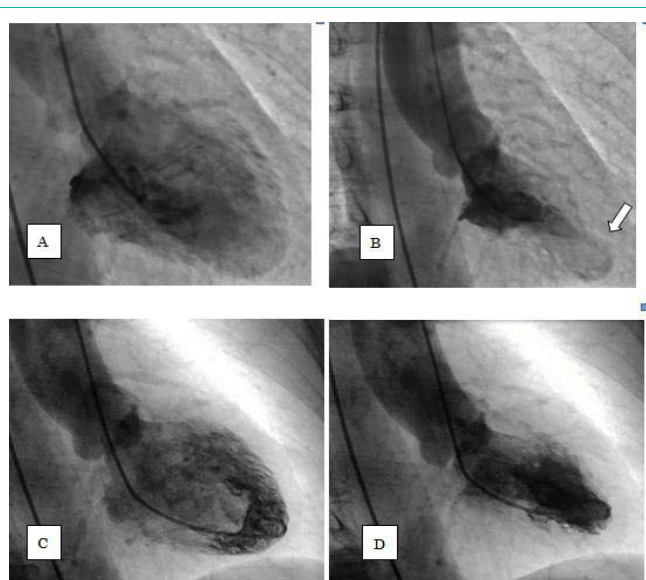
Figure 2: Left ventriculography showed hypokinesis of cardiac apex (A,B), but it was improved one year. Later (C,D).

stenosis. The filling defect in the distal portion of the LAD artery, which is not usually observed in the occlusion of acute coronary