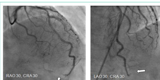
Figure 1: Filling defect in distal portion of left anterior descending (LAD) artery.

Keywords: Acute coronary syndrome; Vasospastic angina; Thrombosis; Angiography