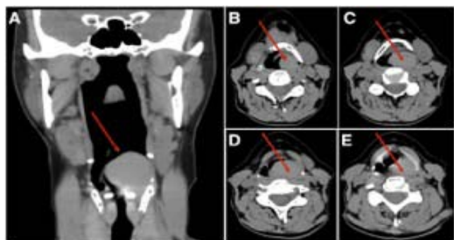
Figure 1: CT neck showing left supraglottic mass on coronal (A) and axial (B-E) sections.