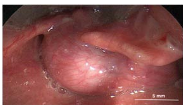
Figure 2: Intra-operative image showing large, well-circumscribed mass arising from left aryepiglottic fold.