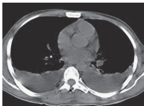
Figure 1: Axial section of a CT of the thorax showing bilateral pleural effusion.

Acute leukaemias rarely present with or are accompanied by pleural fluid involvement. Possible causes of pleural effusion include extramedullary proliferation of a quiescent leukaemic clone with metastasis to the bone marrow, infections, other solid tumours, and complication of chemotherapy [7]. In our case, resistant or progressive disease might be the possible aetiology. In some patients, the pleural effusion responds to treatment, whereas the resistant or the relapsing patients may necessitate a pleurodesis [8,9]. However, according to the literature, presence of pleural effusion may be a poor