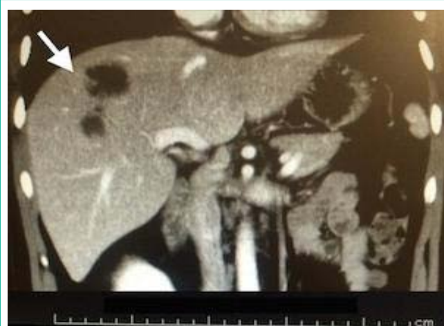
Figure 1: Computed tomography demonstrated liver abscesses (arrow).

His laboratory test results were significant for pancytopenia and elevated liver enzymes: white blood cell count: 2,100/ \mu L with a normal differential; hemoglobin: 11.9 g/dL; platelet count: 8.3 \times 10^4 / \mu L; aminotransferase: 235 IU/L; alanine aminotransferase: 144 IU/L; lactate dehydrogenase: 1,272 mg/dL; alkaline phosphatase: 617 IU/L; and \gamma -glutamyltranspeptidase: 248 IU/L. Ferritin level was 88,774 ng/mL (normal range: 20–220 ng/mL), and soluble interleukin-2 receptor was 721 U/mL (normal range: 145–519 U/mL). Multiple cultures of blood, urine, and sputum were negative for bacteria, mycobacteria,