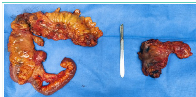
Figure 2: Right colon and rectal specimens.

The surgical time was 195 minutes, and the estimated intraoperative blood loss was 100ml. Patient resumed flatus 36 hours after surgery, and oral liquid diet was resumed on the 3rd day after surgery. The pathological report staging of right colon cancer was AJCC stage II (pT3N0M0), with moderately differentiated adenocarcinoma and negative circumferential margin. No positive lymph nodes were found in the 20 harvested lymph nodes. The pathological report staging of rectal cancer was