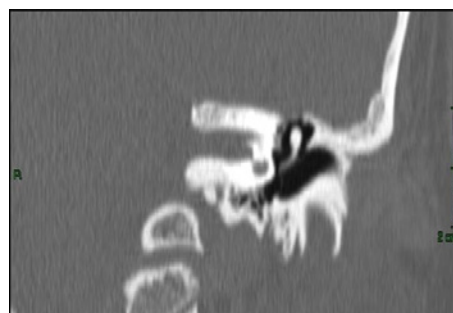
Figure 3: CT left ear: Normal left middle ear.