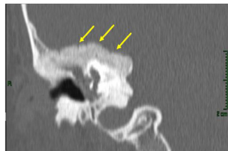
Figure 4: CT right ear: Hyperostotic reshaped right temporal bone (see arrows).