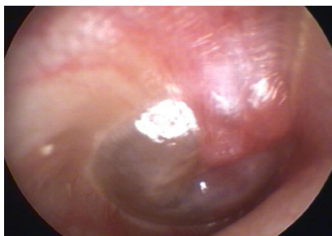
Figure 1: Otomicroscopy: Right tympanic membrane, with epitympanic bulging and middle chronic effusive otitis.

We performed a negative rhinofibroscopy. So after three months of observation and local therapy with nasal corticosteroid and tubal gymnastics with Otovent, we placed a transtympanic tube, with good hearing recovery. After six months the tube was expelled