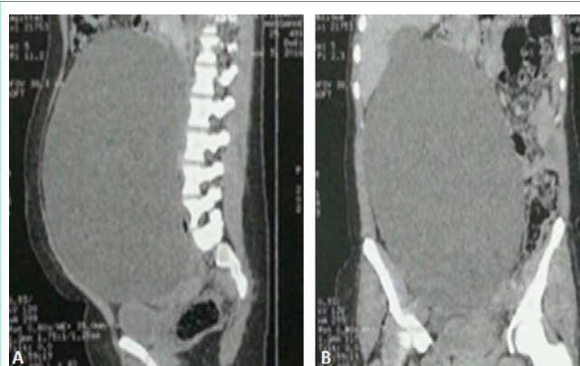
Figure 1: Magnetic Resonance Imaging (A: Sagittal section, B: Coronal section) showing large abdominal cystic lesion displacing spleen, liver and bowel.

The definition of giant ovarian cysts has not been well described in the literature. Some authors define large ovarian cysts as those more than 10 cm in diameter, other defined as those reaching above the umbilicus [3,4]. Our case well fits into the criteria of giant ovarian cyst, it being 62×45cm on MRI and extending up to xiphoid process. The clinical symptoms of giant ovarian cyst are usually progressive increase of abdominal circumference and pressure, non specific diffuse abdominal pain, and other symptoms related to organs compression. Physical examination usually shows abdominal distension mimicking ascites. There are many giant abdominal lesions which enter into the differential diagnosis with giant ovarian cysts. In this case, out of ascites, it was clinically confused with other gynaecologic masses (large uterine tumors), and non-gynecologic cysts (omental cysts, splenic cysts, mesenteric cysts, cysts arising from the retroperitoneal structures, cystic lymphangiomas and