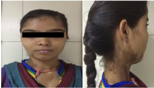
Figure 1: Showing front view and lateral profile of the patient demonstrating Caif au laite spot.

The twin sister was evaluated for features of MAS. She did not have café au lait macules or skeletal deformities at the time of evaluation. There were no clinical features to suggest Cushing's syndrome, thyroid hormone or growth hormone excess. Her hemogram, liver and kidney function tests were normal. Her skeletal survey, bone scan and hormonal profile were normal. Her investigations revealed normal free T4 levels (1.20 ng/dl, normal range 0.93-1.70 ng/dl) with normal TSH (3.5 microIU/ml, normal range 0.27-4.2 microIU/ml). Her serum IGF-1 levels were also normal (400 micrograms/l, normal range 180-780 micrograms/l).