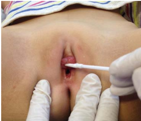
Figure 1: Tumor occupying Urethral Meatus.