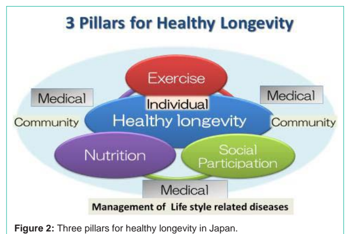
Figure 2: Three pillars for healthy longevity in Japan.

interventions. “Houseboundness” refers to people who answered “no” to question 16. “Low cognitive function” referred to participants who had at least one or more negative conditions in questions 18-20, and “Depression risk” referred to elderly people who had two or more negative responses (questions 21-25). We clarified the usefulness of Kihon Checklist for the prediction of future disability of community dwelling older peoples using future LTCI certification [15,16]. “Low physical strength”, “Low nutritional status”, “Low cognitive function” and “Depression risk” in Kihon Checklist were strongly associated with 3 years later certification of LTCI. Thus, Kihon Checklist could be useful for prediction of future disability status of older peoples and high risk of needing future care or support in LTCI [17]. Interventions and preventions for physical strength, nutritional status, cognitive decline and depression are supposed to be very important. Actually, various preventive intervention programs were provided in the community by the local government, and they have proven to be effective for preventing functional or cognitive decline