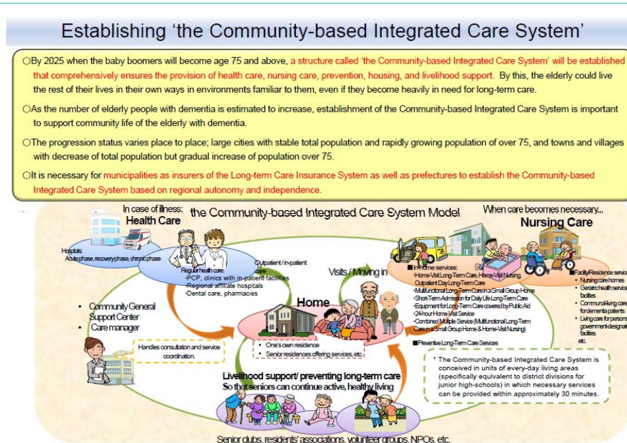
Figure 1: Community-based integrated care system. From Japan Ministry of Health, Labor and Welfare website (Ministry of Health, Labour and Welfare 2016) [31].