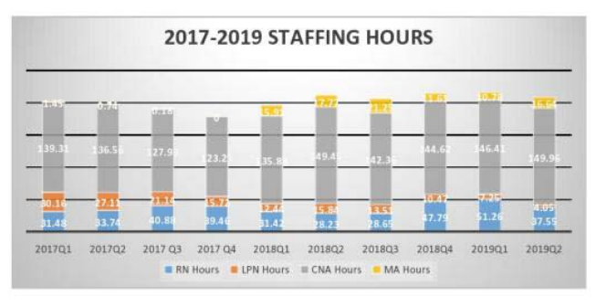
Figure 3: Combined Staffing data.

There were significant changes in the various staffing hours over time - this was true for all four categories (i.e. RN, LPN, CNA, and MA) (Figure 2). RN hours significantly decreased from quarter 1 to quarter 2 (3.24 hours, p<0.05) and significantly increased from quarter 1 to quarter 4 (16.2 hours, p<0.01) and from quarter 2 to quarter 4 (19.4 hours, p<0.01). LPN hours significantly increased from quarter 1 to quarter 2 (3.4 hours, p<0.01) and significantly decreased from quarter 2 to quarter 4 (5.23 hours, p<0.01) and quarter 3 to quarter 4 (2.83 hours, p<0.01).