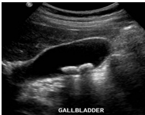
Figure 1: Abdominal USS demonstrating gallstones in the gallbladder. Gallstones are differentiated from gallbladder polyps in that they cast an acoustic shadow and move when the patient alters position.