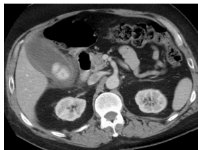
Figure 4: Acute cholecystitis on an axial slice of a CT scan demonstrating a thick gallbladder containing a calcified stone, pericholecystic fluid and fat stranding indicative of surrounding inflammation.

The management of cholecystitis consists of good analgesia, oral or intra-venous antibiotics depending on the severity, and cholecystectomy during the index admission or at a later date. Early surgery offers definitive treatment but if it is undertaken after 48