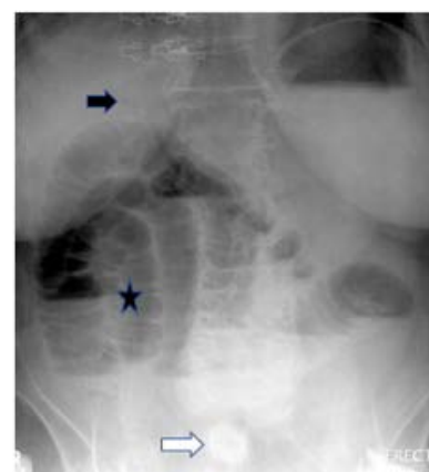
Figure 5: Rigler's triad: pneumobilia (black arrow), gallstone in the right lower quadrant (white arrow), dilated small bowel loops (star).

hours from the onset of symptoms it may be technically difficult due to the presence of inflammatory obscuring the normal anatomy [3].