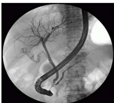
Figure 3: ERCP: the image demonstrates the endoscope cannulating the second part of the duodenum and contrast material highlighting the gallbladder, which contains gallstones, and the biliary tree.

by a thickened gallbladder wall with pericholecystitis fluid. Computed tomography scanning will also demonstrate these signs of cholecystitis, including surrounding fat stranding consistent with inflammation (Figure 4).