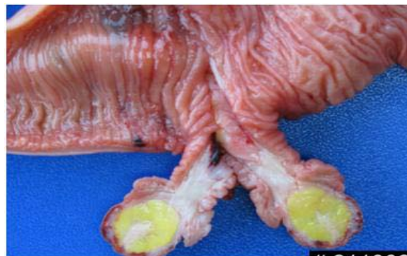
Figure 2A: Gross picture of this resected small intestinal tumor.