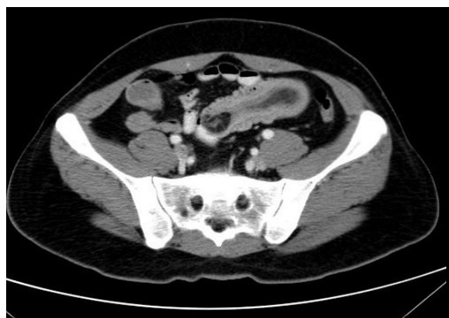
Figure 1A: Axial contrast-enhanced abdominal CT showed a well-demarcated cylindrical mass, the leading point of which was a homogenous fat density lesion in the lumen.

A 41-year-old man presented with passage of dark red stool, nausea, vomiting and abdominal crampy pain. Physical examination revealed pale conjunctivae and local tenderness over the periumbilical region