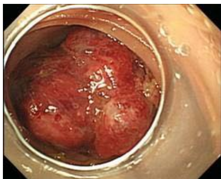
Figure 1B: Enteroscopy revealed a single, irregular, hyperemic, firm, ulcerative tumor that occupied the lumen of the distal ileum with ileal intussusception.