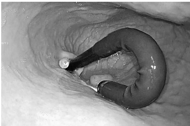
Figure 2: The tumor was identified and resected with an adequate margin in all directions using linear staplers under the guidance of oral endoscope.

to the treatment strategy. The indication criteria for this procedure were a tumor locating in the upper and middle stomach or near the esophagogastric junction with an endophytic growth, and a tumor less than 5 cm in diameter and 8 cm 2 in cross-section for the specimen removal from the mouth.