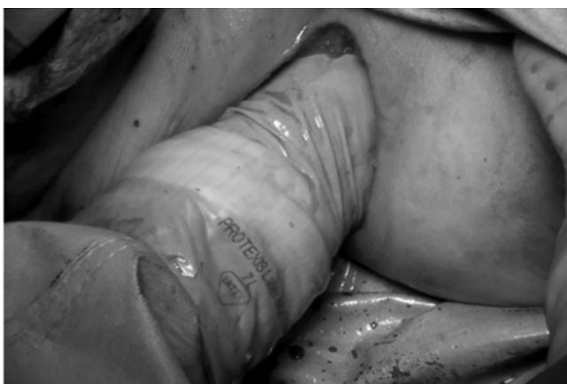
Figure 1: Left hand insertion.

Although an extraperitoneal colostomy is often performed to prevent postoperative parastomal hernia formation after an open abdominoperineal resection for rectal neoplasm's, it is not typically conducted via a laparoscopic approach because of the difficulty associated with the extraperitoneal route [1]. We describe a simple hand-assisted laparoscopic extraperitoneal sigmoid colostomy technique performed via a perineal incision. After the laparoscopic abdominoperineal resection, the surgeon inserted his left hand into the pelvis via a perineal incision (Figure 1). Then, under laparoscopic guidance, gently separated the peritoneum from the posterior aponeurotic plane to create an extraperitoneal tunnel using the fingers (Figure 2), just as in open methods. We performed the peritoneal separation from the previously dissected paracolic gutter toward the proposed stoma site in the left flank. The pneumoperitoneal pressure was maintained within the normal range during entire procedure. This surgical technique is easy, and helps to prevent the development