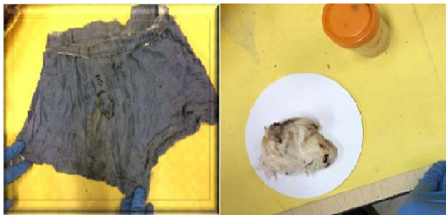
Figure 1: Shows the underwear and blood gauze of known accused claimed by the victims.