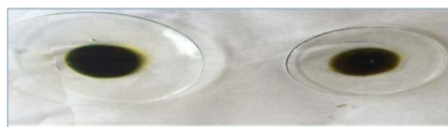
Figure 1: Showing frohede's test for sample.

In examining a "Heroin" sample the primary necessity is to identify the diacetylmorphine with complete certainty, or to identify the narcotic substances present [3]. The present study was to determine best solvent systems for the separation of diacetylmorphine (Heroin) along with other opium alkaloids and adulterants present in samples of illicit heroin by using chromatographic techniques.