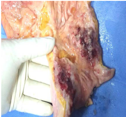
Figure 1: Gross examination: cut surface of large intestinal mucosa showing red brown ulcerated areas with thickened ulcer margin.