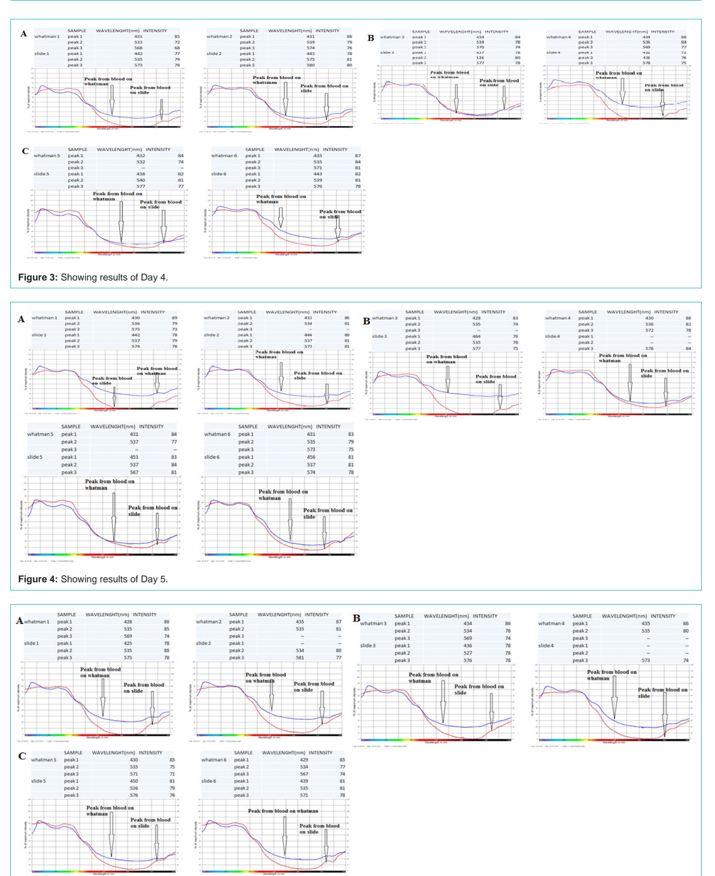
Figure 5: Showing results of Day 8.

Submit your Manuscript | www.austinpublishinggroup.com