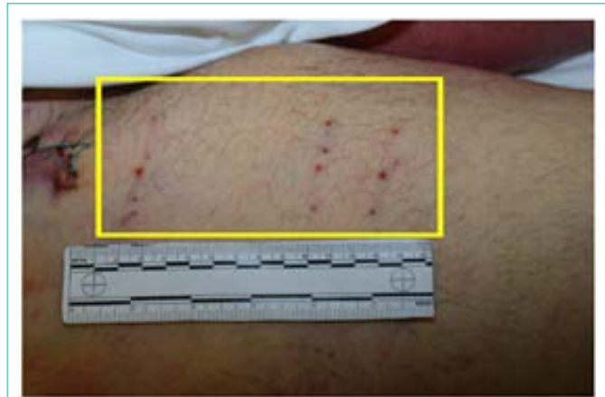
Figure 2: Taser® Three linear roughly parallel wounds, anterior face of the right thigh, with four dots shaped wounds in each.