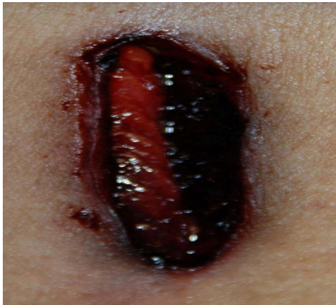
Figure 1: Wound produced by single-edged knife in autopsy case. Correct assessments: 23%.