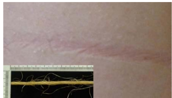
Figure 3: Ligature mark produced with an hemp rope (down-left): Correct assessment: 25%.